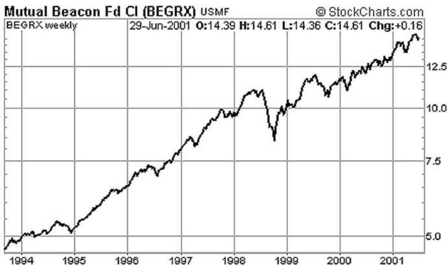
FIGURE 30.1 Mutual Beacon Fund's Performance, 1994–2001.