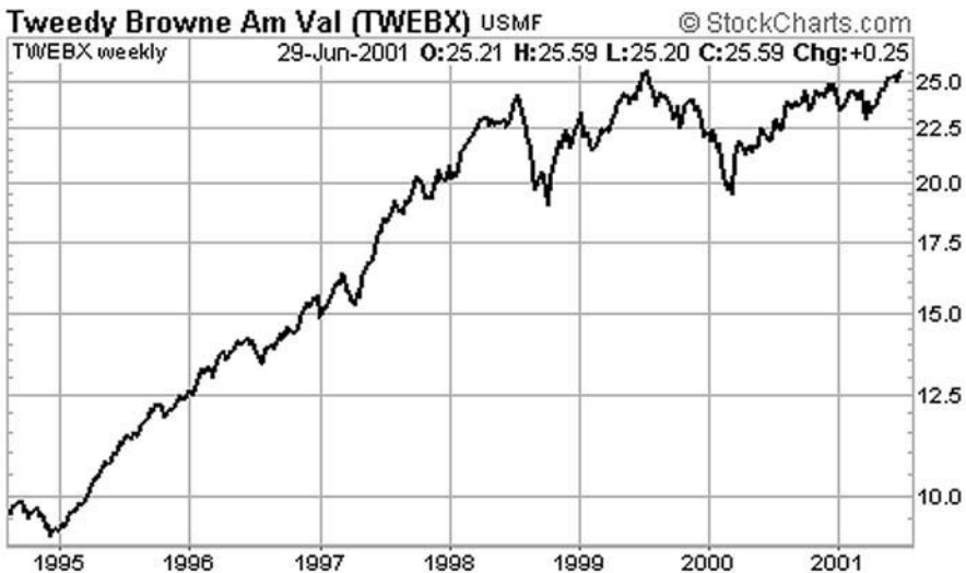
FIGURE 24.1 Tweedy, Browne American Value Fund's Performance, July 1995–August 2001.

The funds share some of the same stocks.