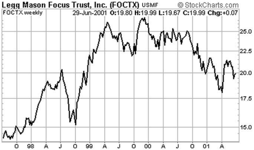
FIGURE 22.1 Legg Mason’s Focus Trust’s Performance, July 1998–April 2001. Source: StockCharts.com.

ratios, and high dividend yields, aren’t special concerns to him now. That wasn’t characteristic of Graham. The Graham strategy—low p-e ratios, low price to book—wasn’t consistently successful after the 70s and early 80s.